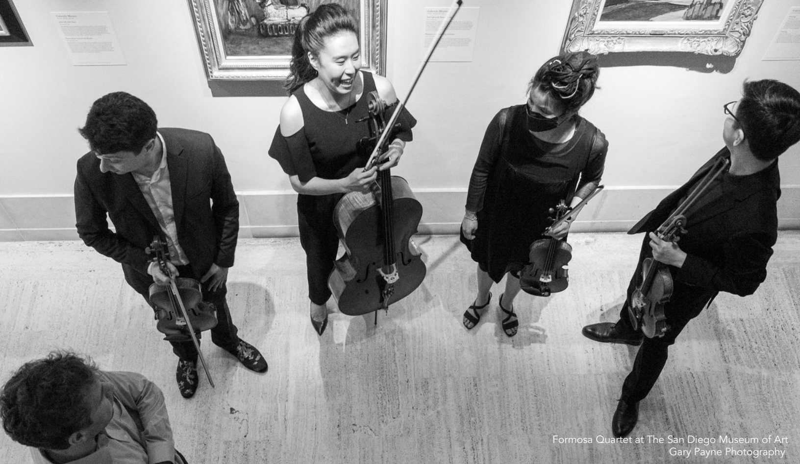
Formosa Quartet at The San Diego Museum of Art