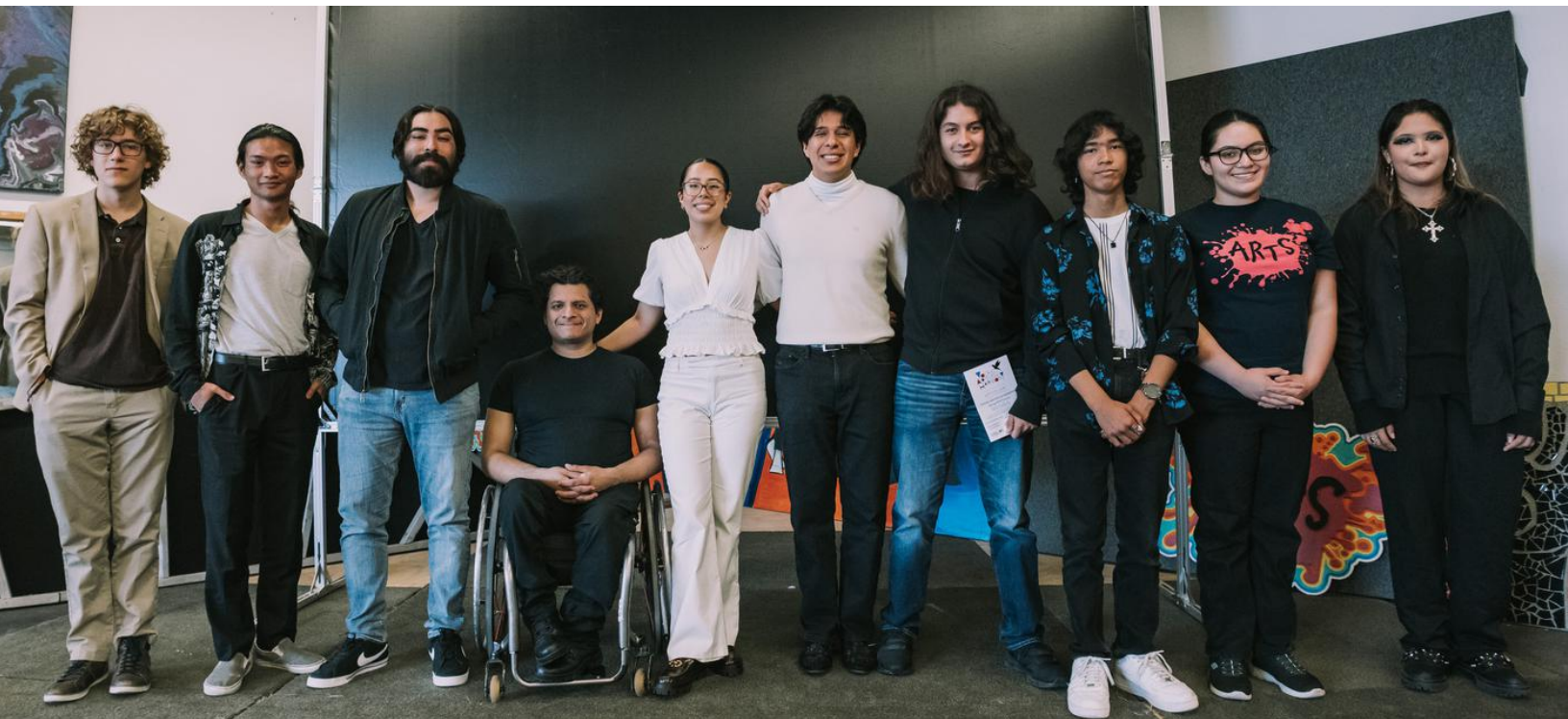
Young Artists in Harmony Spring 2023 participants

For the past nine years, Art of Elan has offered its “Young Artists in Harmony” (YAH) program in partnership with the nationally recognized A Reason To Survive (ARTS), an organization that believes in the power of the arts and creativity to literally transform lives. YAH consists of weekly workshops where high school and community college students have the opportunity to explore musical composition with professional musicians, to create and be part of a professionally recorded public performance, to meet and collaborate with other like-minded music students of high school and college age, and to build a musical composition portfolio. Participants in YAH receive weekly mentoring and coaching from professional Art of Elan musicians who workshop and provide feedback on student works. This unique program culminates each semester with a multidisciplinary and collaborative concert that showcases original compositions the students create over the 6-10 week period, performed by Art of Elan musicians. Each concert is professionally recorded and is available for free streaming and download on Instant Encore.